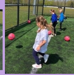
Rea Class developing their football skills at Lacon Childe