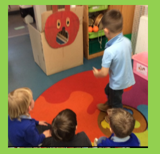
EYFS Caterpillar Update

Our caterpillars have grown even longer. The children observed how the caterpillars have drastically changed in size. They also noticed that the caterpillars have become very hairy! Soon it will be time for the caterpillars to make their way towards the top of the jar, where they will prepare to hang down and form their chrysalis. Did you know caterpillars have 16 legs!